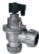
Automatic cleaning system