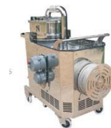
Stainless/Flame proof models