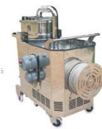
Stainless/Flame proof models